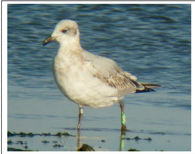
Mediterranean Gull Stanpit Aug 2010