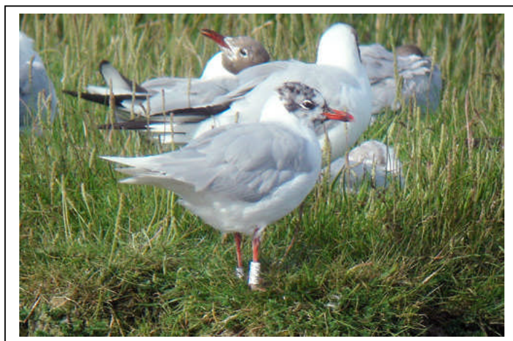
Mediterranean Gull Stanpit Alan Hayden

E907697 7F 17/05/2007 Oost-Vlaanderen, BELGUIM VV 24/07/2008 Stanpit Marsh, 422km 1 yr 68 days