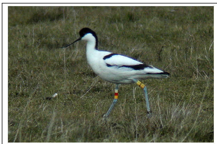
Avocet Stanpit Marsh March 2008

This bird has been seen on many occasions around Northern France before its arrival in the UK. We think this is only the fourth report of a French-ringed Avocet in Britain & Ireland. Up to 2007, only 13 foreign-ringed Avocets have ever been reported in Britain & Ireland.