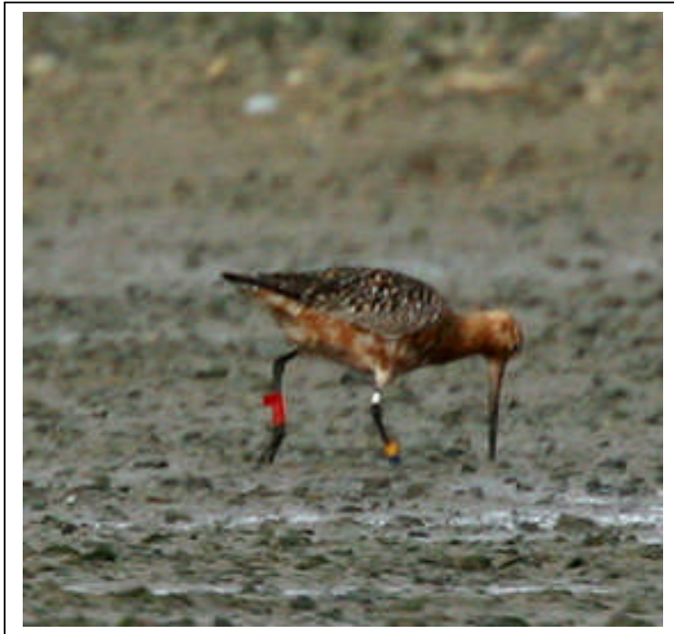
Bar-tailed Godwit Stanpit Marsh May 2008

1504963 ? 21/05/2007 Terschelling, HOLLAND VV 18/05/2008 Stanpit Marsh - 362 days