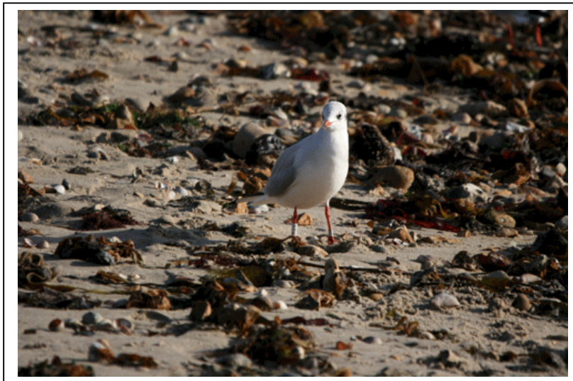
Black-headed Gull Stanpit Nov 2009 Darren Hughes

6H3064 8M 28/03/2008 Copenhagen, DENMARK VV 16/11/2009 Christchurch Harbour – 1103 Km VV 26/03/2010 Copenhagen, DENMARK