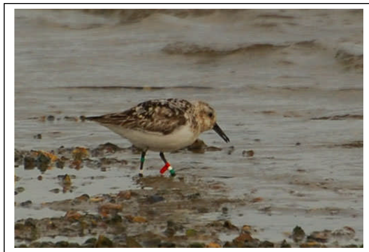
Sanderling Stanpit Aug 2009